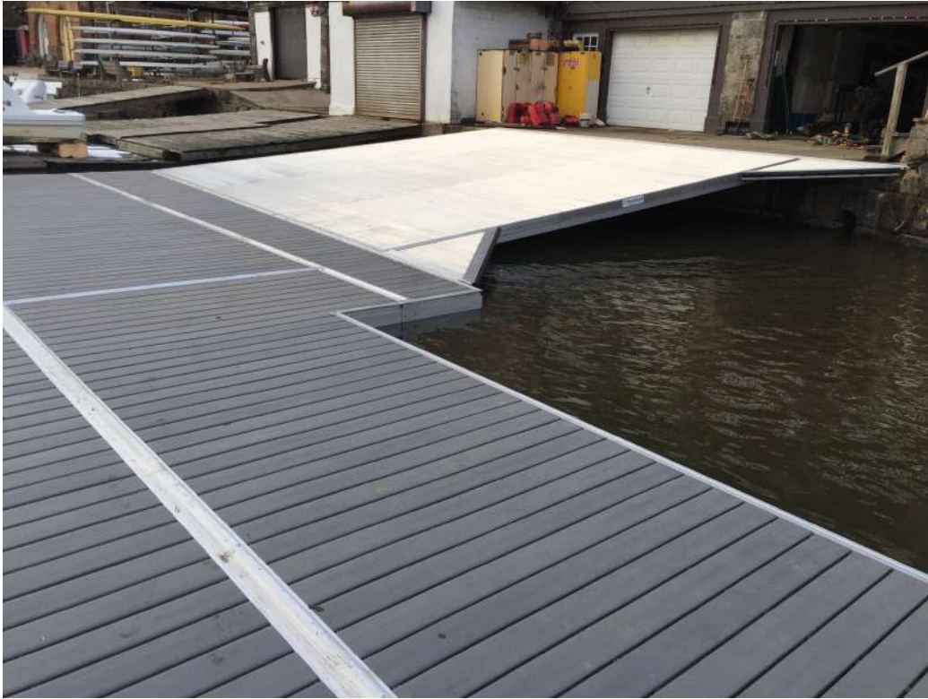
Completed PA Barge Club Dock and Gangway