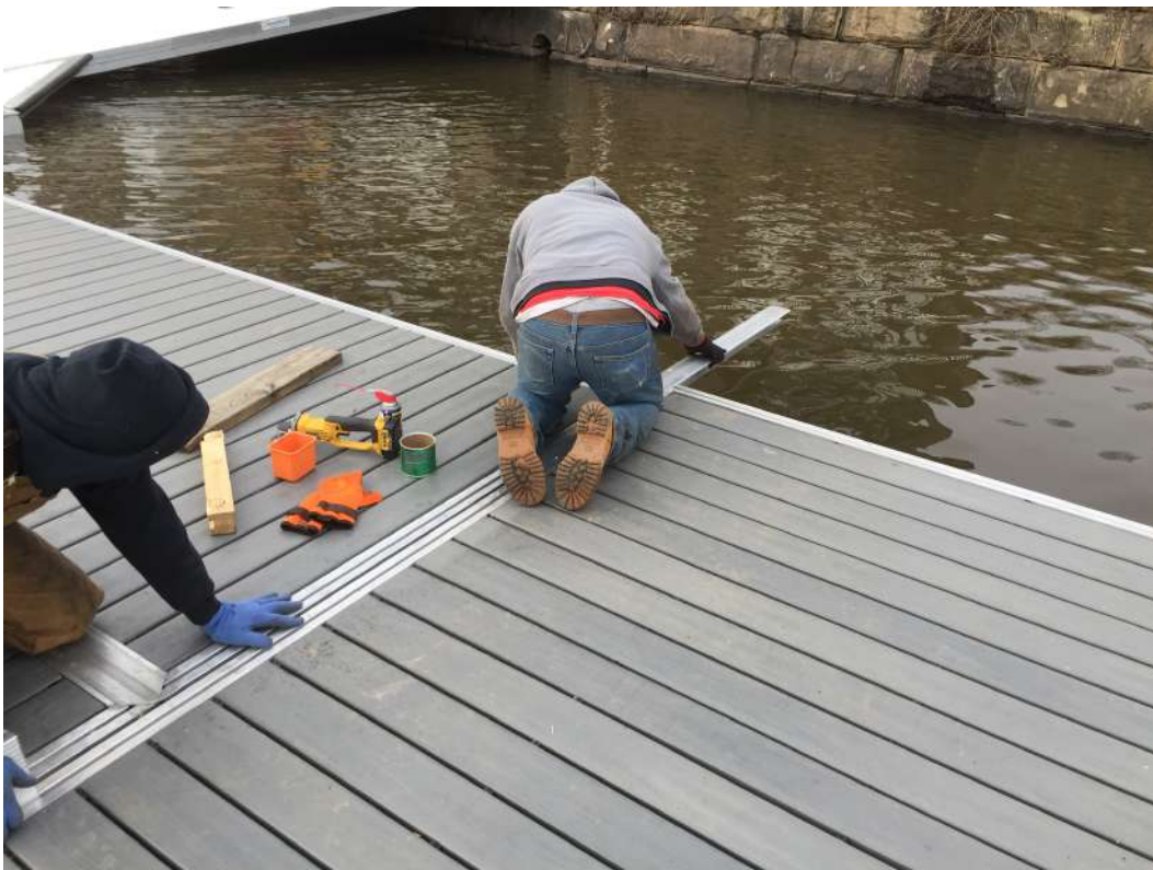
Installing BoardSafe Connection Strips between dock sections