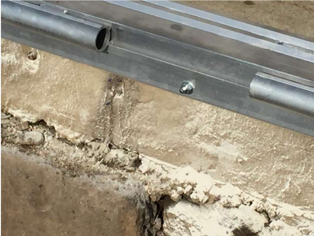
Attachment of BoardSafe Mounting Angle to Existing Concrete Bulkhead