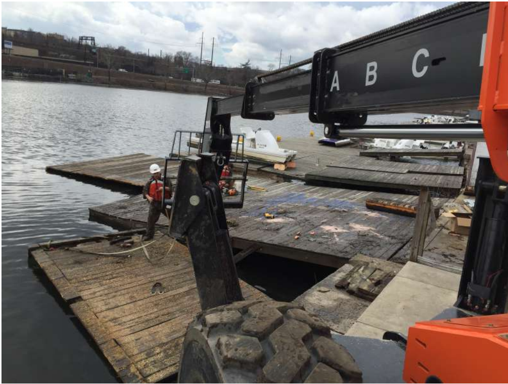
Demolition of Pressure Treated Docks