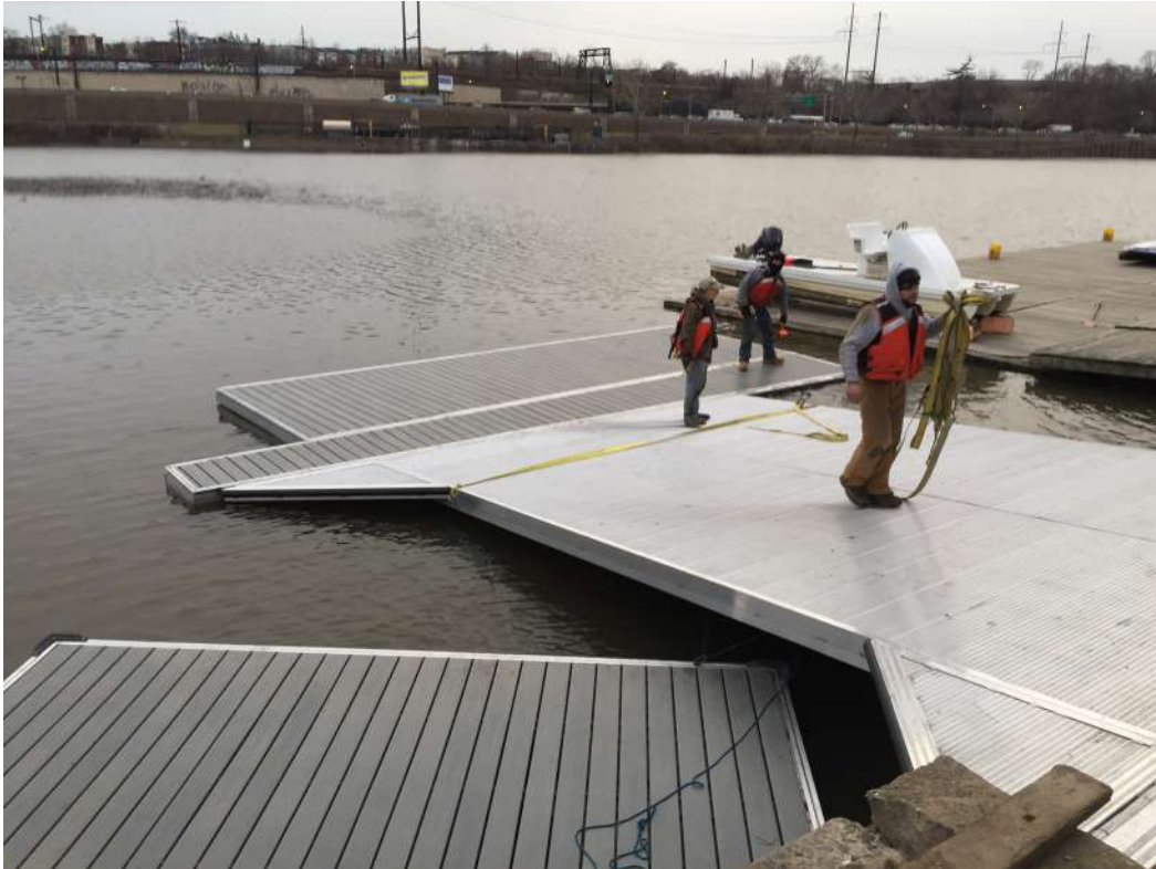
Installing BoardSafe 50 Series Low Profile Rowing Docks