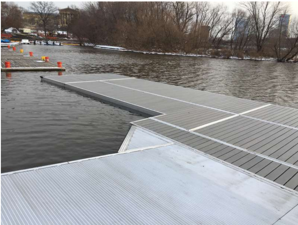
Completed PA Barge Club Dock and Gangway