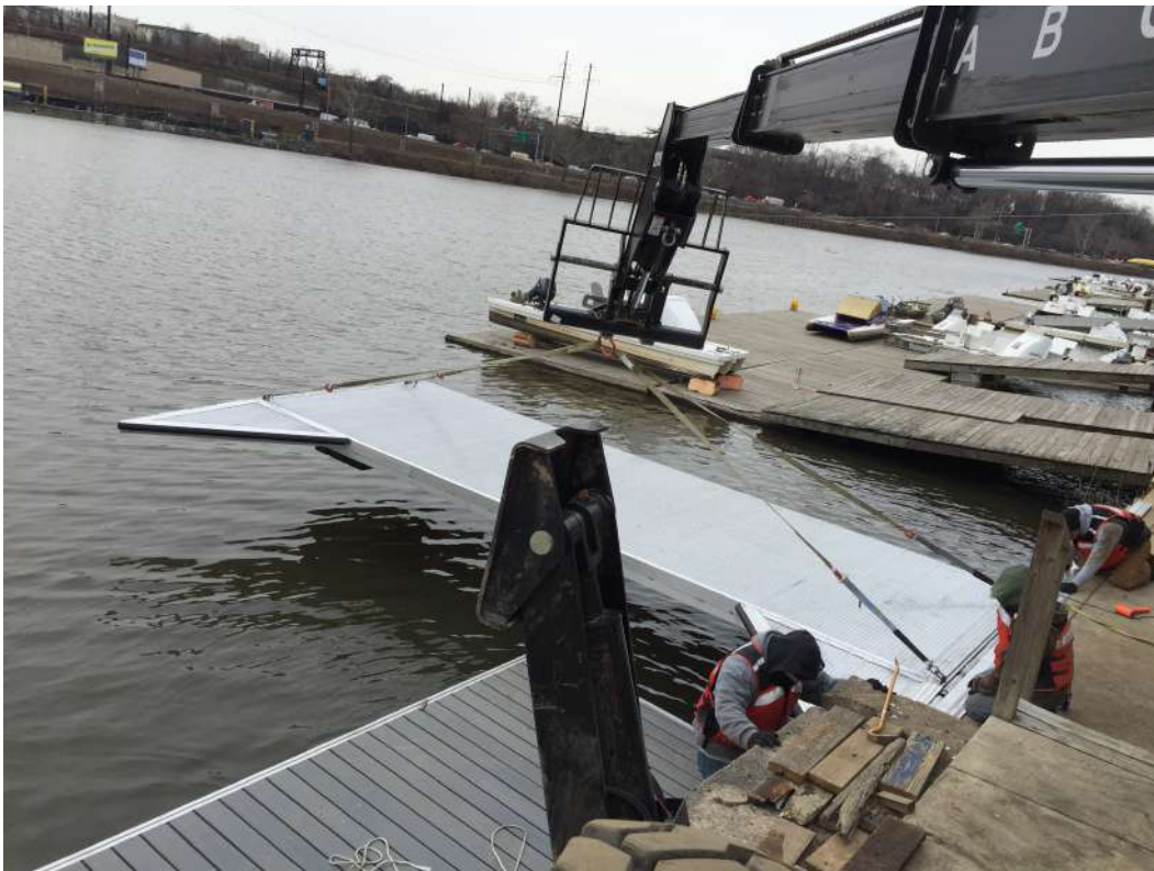
Setting first BoardSafe Gangway Section- Supplemental flotation installed under each gangway section