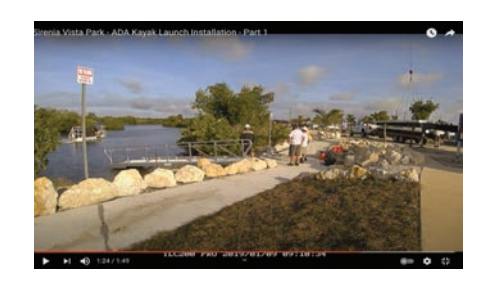
Review from Cape Coral